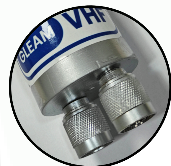
N Type Connector